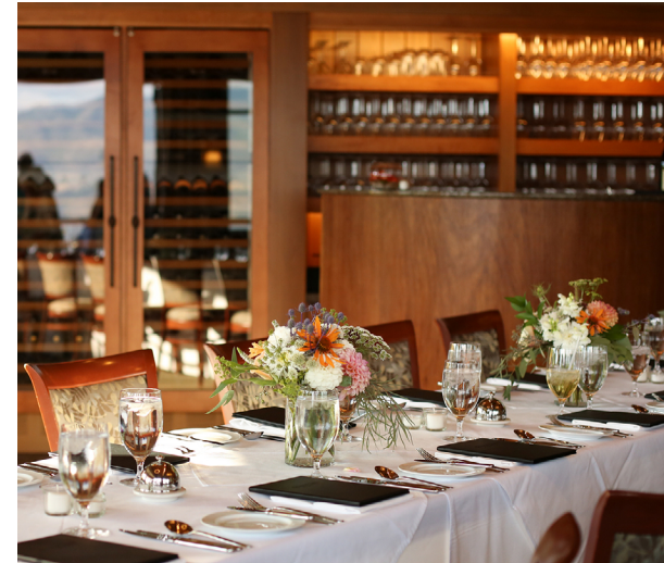
STEWART FAMILY ROOM 36 guest maximum for seated dinner 45 guest maximum for standing reception