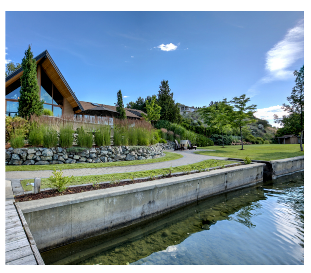
THE LAKE HOUSE 60 guest maximum