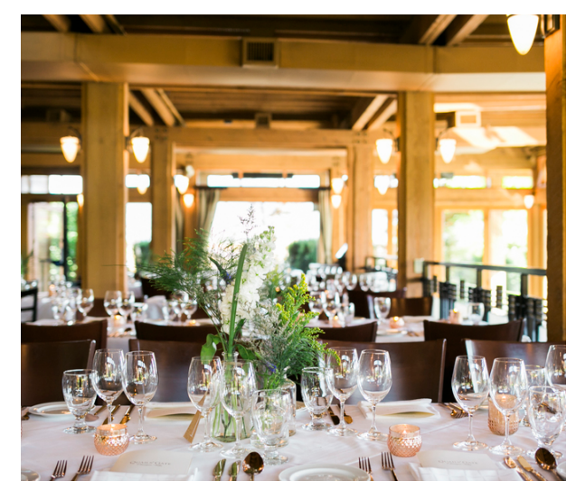
OLD VINES RESTAURANT 90 guest maximum for seated dinner 110 guest maximum for standing recption