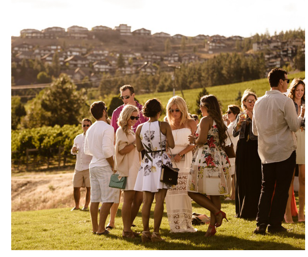
HARVEST GATHERING SITE 300 guest maximum for standing reception