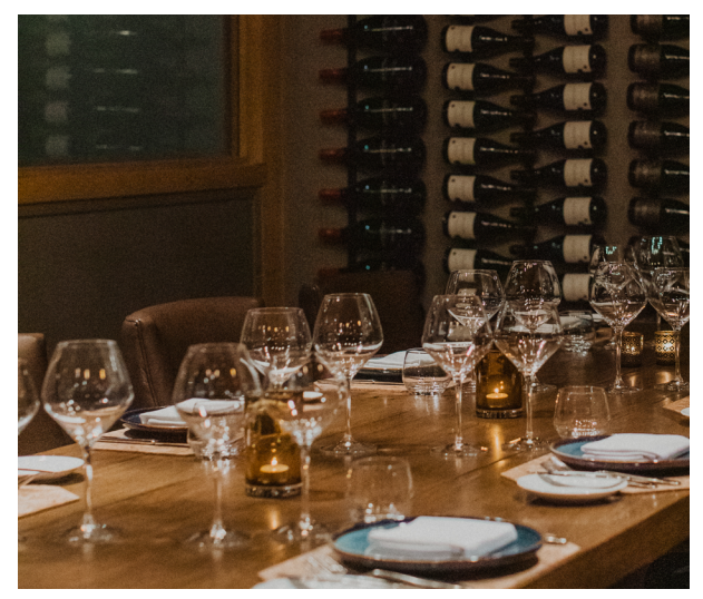
STEWART FAMILY LIBRARY 14 guest maximum for seated dinner

Quails' Gate pairs perfectly with corporate team-building. From the boardroom to the Stewart Family Room and our Lakehouse, we can help you arrange activities, catering (from our award-winning culinary team), and private wine-tasting experiences. From intimate family gatherings and business meetings to headline events, we'll help you customize your function for groups of 10 or more.